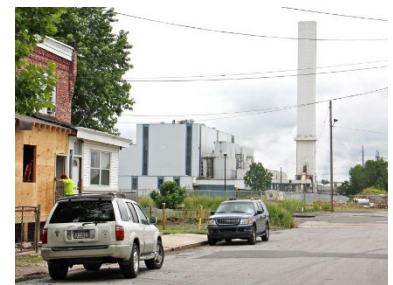
Reworld Delaware Valley incinerator in Chester

Same prices for delivery to the two transfer stations in the city (Philadelphia Transfer Facility and Recycling Center and the Forge Transfer Facility) or directly to Fairless Landfill or the Wheelabrator Falls Incinerator, both of which are in Falls Township, Bucks County.